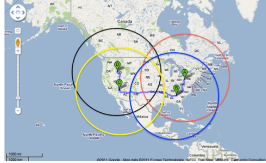
Fig. 1 Geographical origin of Twitter data: A is Pittsburg, B is Atlanta, C is Las Vegas and D is Boise